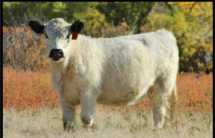
Heifer at CK Galloways