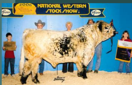
SAF Meridian: 2006 NWSS Grand Champion Bull