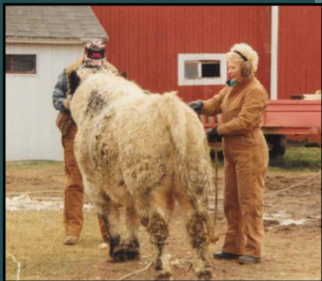
Loveland's Legacy L29 ~ The start of a 32 year love affair!