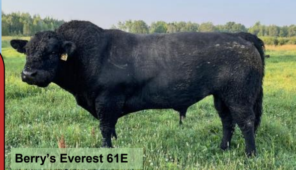
Berry's Everest 61E

5 Time Winner of NWSS Premiere Exhibitor and Breeder Awards