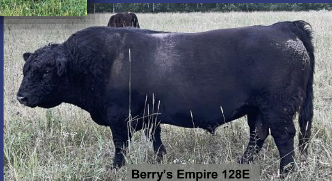
Berry's Empire 128E

Berry's Empire 128E was 2019 NWSS Grand Champion Galloway Bull as a yearling and 2018 NWSS Reserve Grand Champion Galloway Bull as a calf.