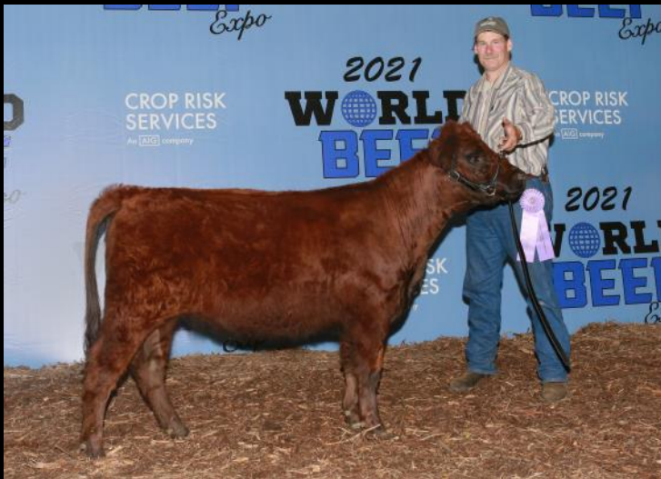
Reserve Champion Female, RPG Hally's Fireball Root Prairie Galloways, Fountain, MN