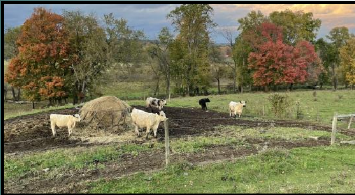
Photos from the 2021 AGBA annual meeting held at Double J Galloways, New Castle, PA