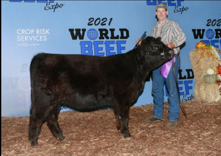
Grand Champion Female, RPG Honda Root Prairie Galloways, Fountain, MN