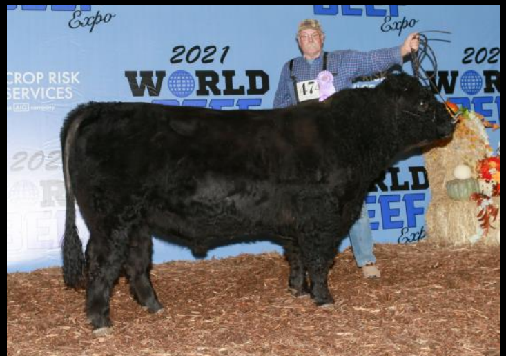
Reserve Champion Bull, Berry's Grand 15G Berry Ranch Galloways, Mora, MN

Breeds with smaller numbers of entries but with their own breed shows were invited to participate in the AOB Championship show, where the Grand Champion bull and female from these breeds showed against each other. Chuck Cole's bull calf "Henry" rose to the top to claim the AOB Champion Bull placing.