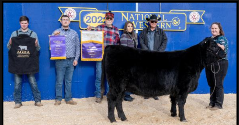
Grand Champion Female Berry's Heavenly 6H