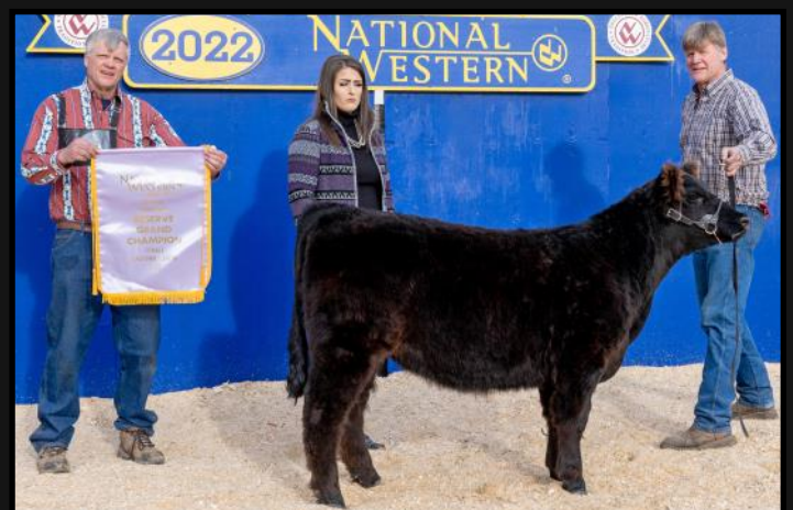
Reserve Champion Female Bar R Kibby 25J