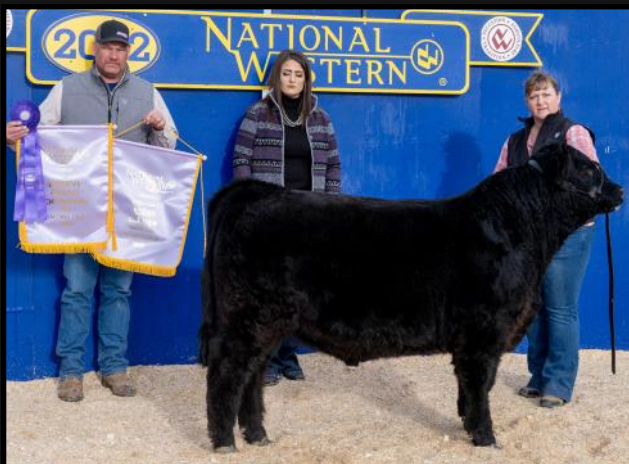
Reserve Champion Bull HB Just Right 3591