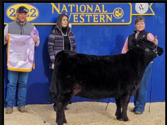
Reserve Champion Percentage Female HB Jasmine5481