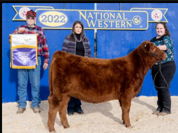
Champion Percentage Female Berry's Miss Red 17