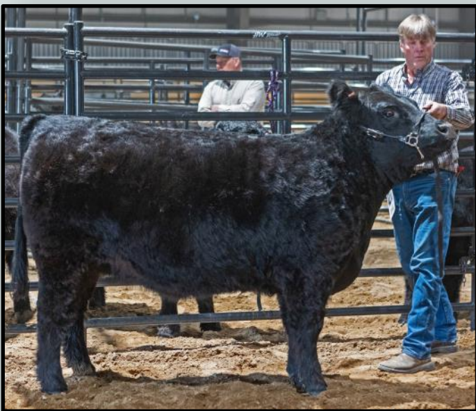
Carcass Champion Bar R Daphine 33H