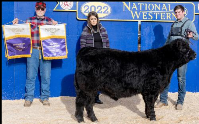
Grand Champion Bull Strand's Jackpot S1J

Galloway: When it absolutely has to be the BEST beef.