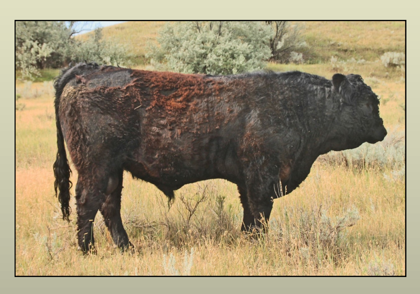
YY Contrail (CA). Owned by Brass Ring Galloways. Submitted by Susan Waples.