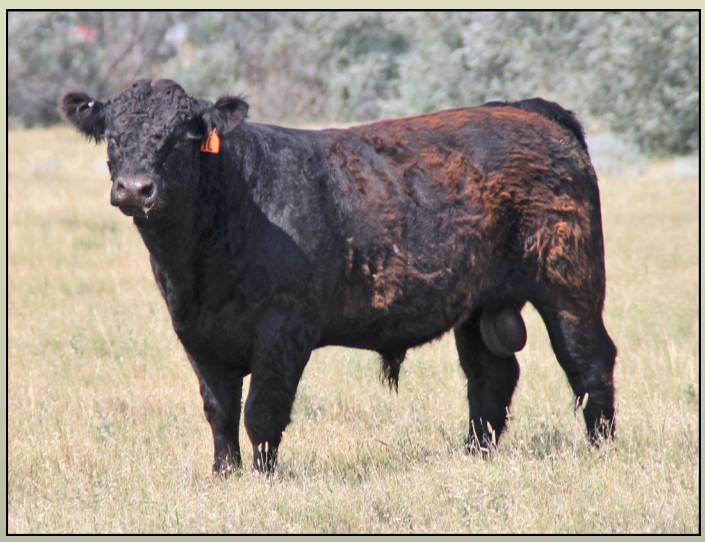
Brass Ring Cadillac. Owned by Brass Ring Galloways. Submitted by Susan Waples.