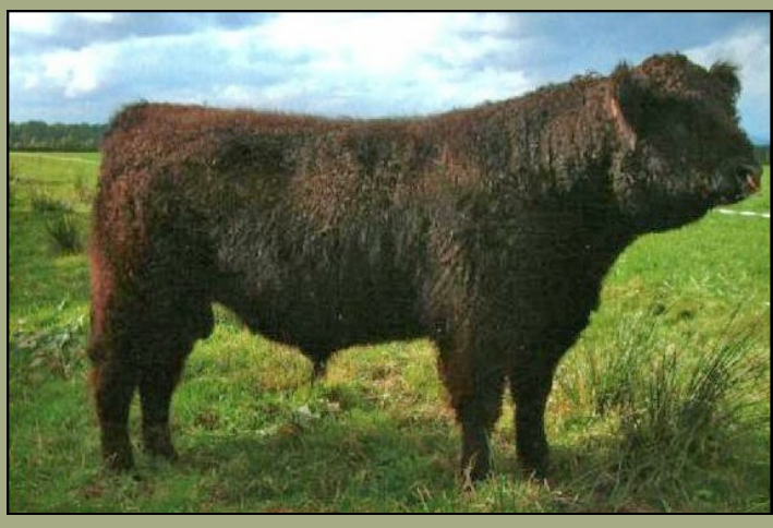
Braveheart, Scottish bull. Berry Ranch will be using him in their 2016 Al program.