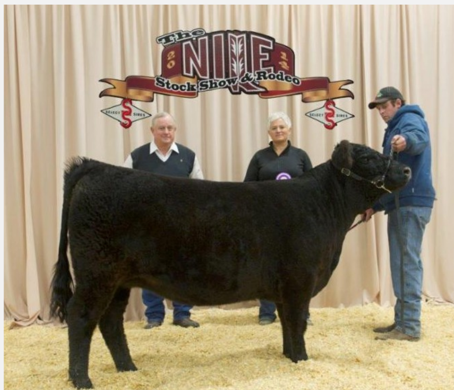
Grand Champion Female CK Abba 22A