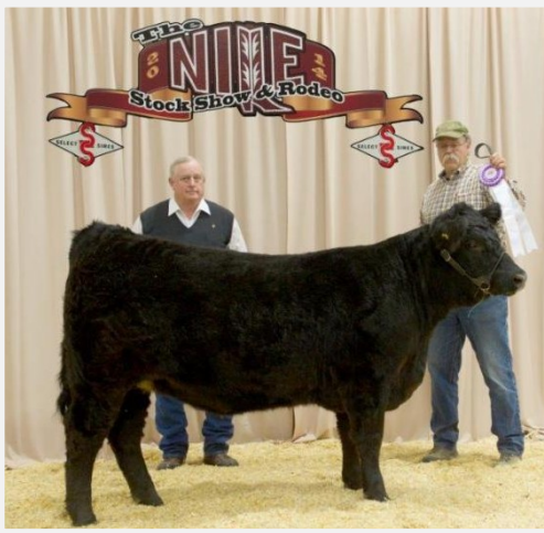
Reserve Champion Percentage Female