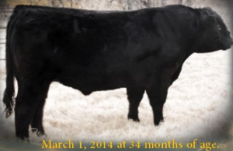
March 1, 2014 at 34 months of age.

In 2012 we brought RFLTD Yankee into our Reg. Galloway Herd He was our Epiphany !!!