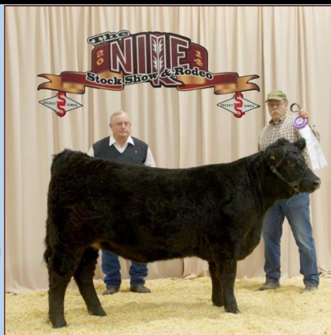
2014 Grand Champion Percentage Female Berry's Heifer BR86 2014 NILE