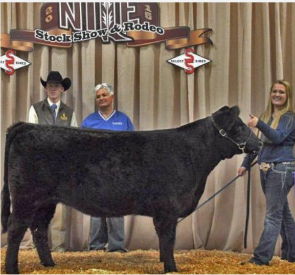
CK Burbank 38B. Bred and shown by CK Gallo- ways, Fort Benton, MT