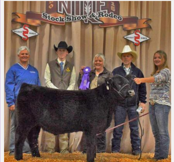
0880. Owned and exhibited by Gillespie Show Cattle, Ethridge, MT