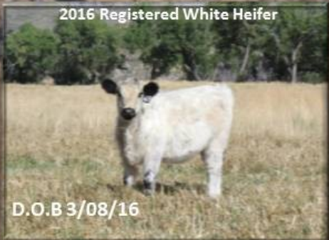
2016 Registered White Heifer