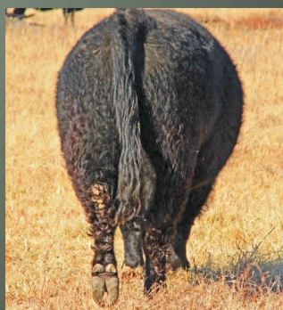
RFLTD Xenon Sire of Our Top Grassfed Carcasses. SEMEN AVAILABLE!

We will have 2 Apostle heifers at Denver in January, one will be available for purchase. Also one or two fall born heifers on the ground currently. These heifers were hot items last April after weaning.