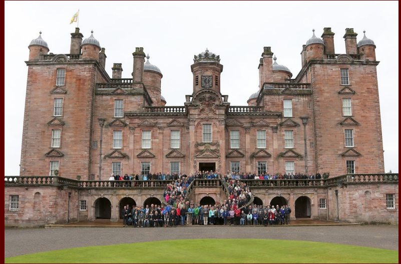
The WGC Delegates pose for group photo at Drumlanrig Castle (above)