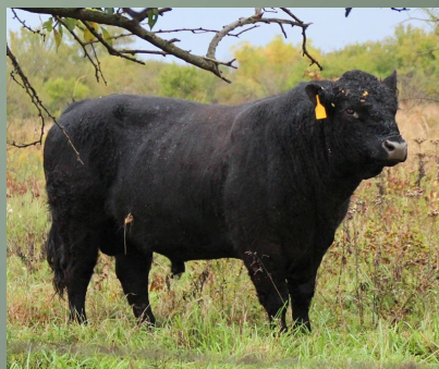
Sr. Herd Sire Brass Ring Apostle 25A