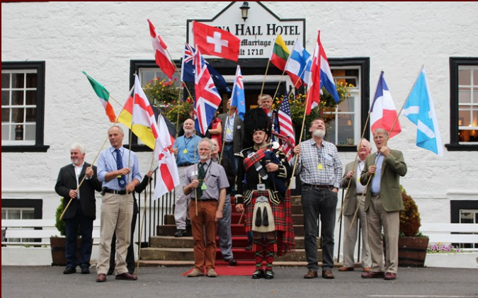
Flags of each country represented at the 2016 WGC.