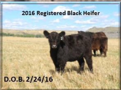
2016 Registered Black Heifer