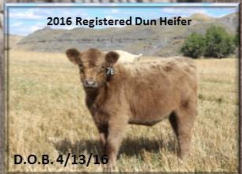
2016 Registered Dun Heifer

* 2016 Heifers * Bred Heifers * White Prospect Bull Calves Let's Visit !