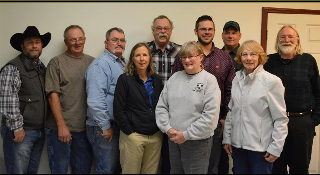
Current Directors as of the October 2016 Annual Meeting.