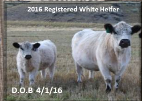
2016 Registered White Heifer

2016 Full Sisters Left: ET calf from DD Ranch's Sephora and Big Deal White Lightning. Right: DD Ranch's Sephora with Big Deal White Lightning sired Heifer.