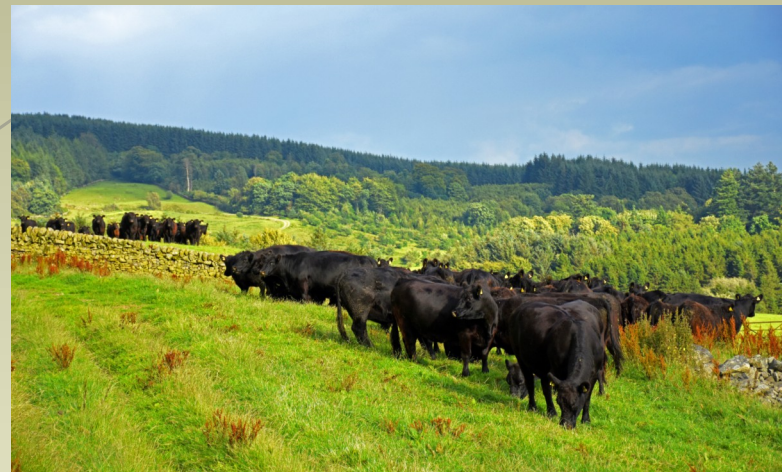
Klondyke Farm Black Galloway Cattle (Above)