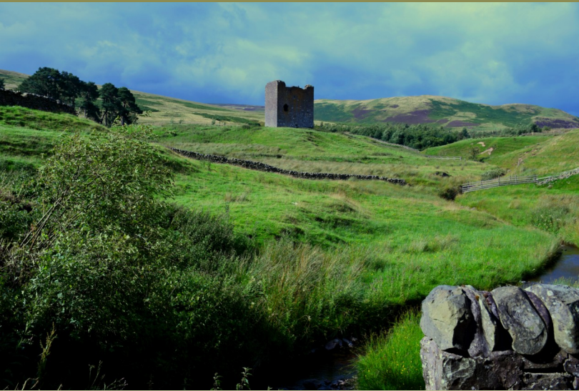
Ancient Watch Tower in the Scottish Hills (left)