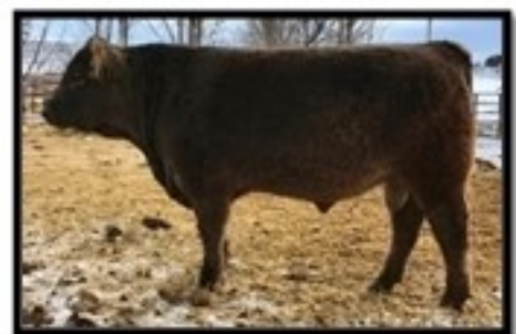
#37 Jan. 2017 Galloway Bull

"Hate to see that bull go - he's been an easy keeper & I have a feedlot full of calves like I've never had before."