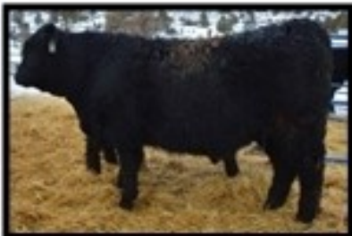
#2607 Feb. 2017 1/2 Galloway Bull