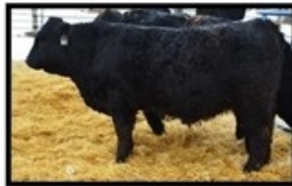
#3407 Feb. 2017 1/2 Galloway Bull