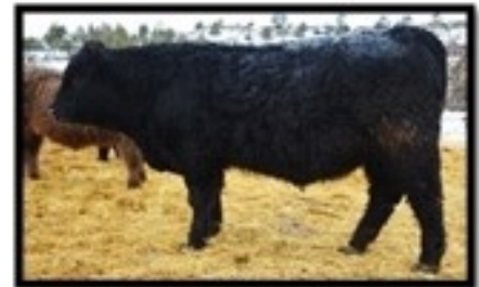
#2 Feb. 2017 Galloway Bull