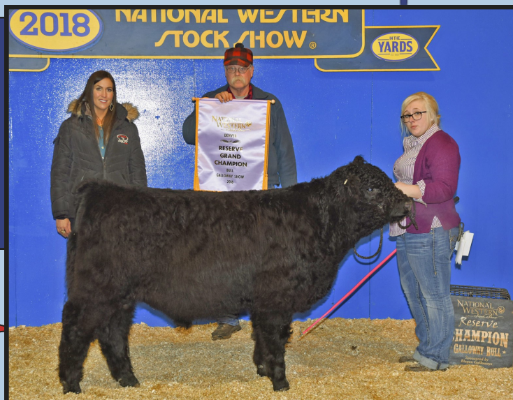
Berry's Empire 128E. DOB 4/25/17. Sired by Scottish Bull 'Ben Lomond Mhordhu'

Give us a call, or send email to eberryranch@gmail.com