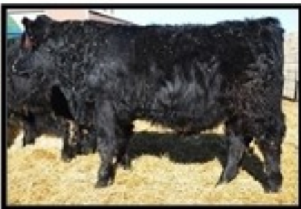
#2647 Feb. 2017 Galloway Bull