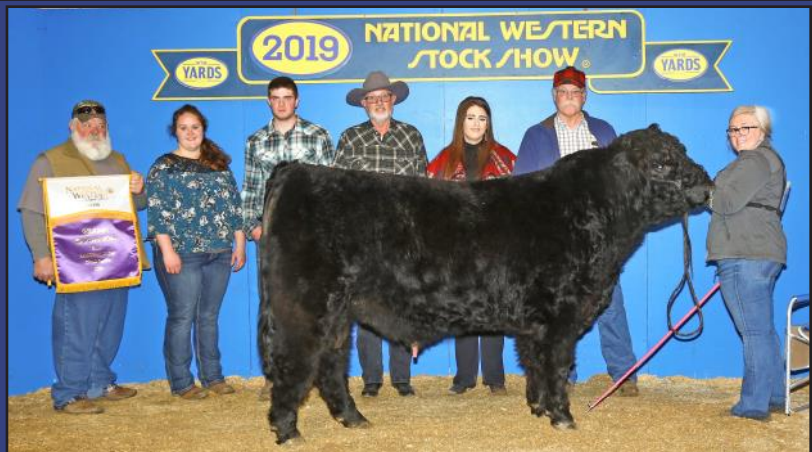
Berry's Empire 128E. Grand Champion Bull, Junior Champion Bull

Give us a call, or send email to eberryranch@gmail.com