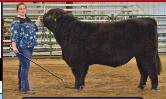
Berry's Dynamic 61D, Senior Champion Bull