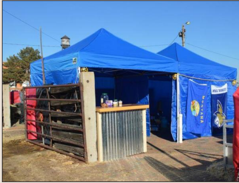
Joe's Bar....Innocent enough by Day.....