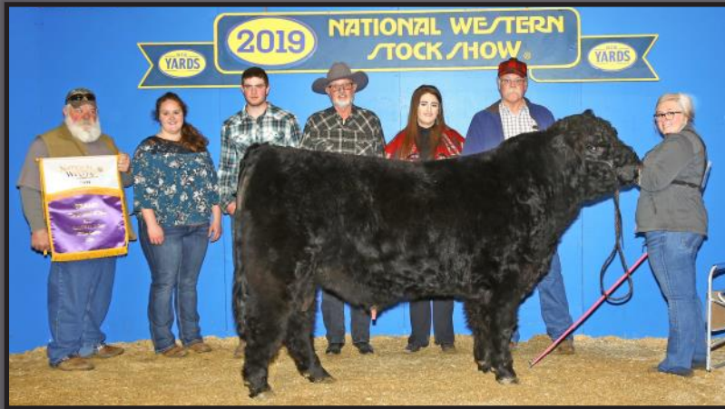
Grand Champion Bull: Berry's Empire 128E