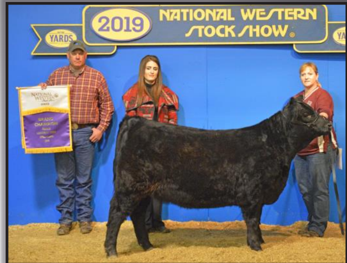
Grand Champion Female: HB Faith 4758