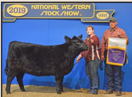
HB Fancy 2608