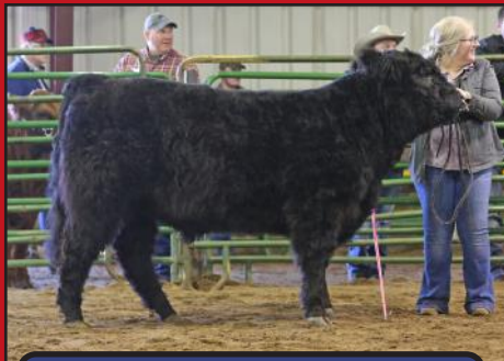
Berry's Everest 61E, Reserve Champion Yearling Bull