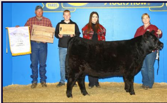
HB Flirt 2198