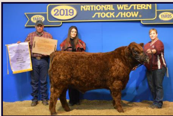
HB Ferrari 2428