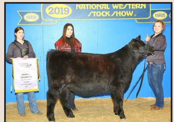
PR Fergie 64F