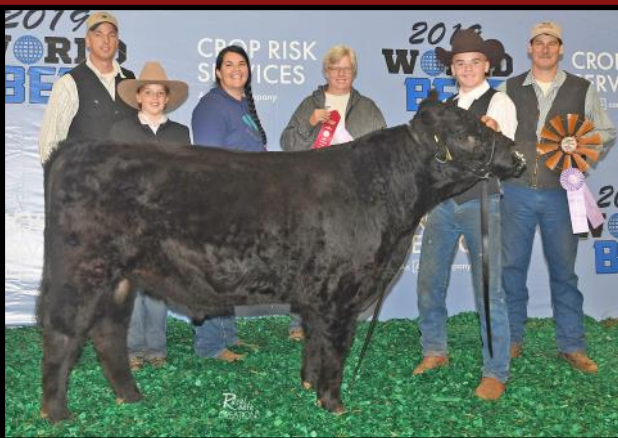
2019 WBE Galloway Show Reserve Champion Bull RPG Fletch, owned by Root Prairie Galloways, Fountain, MN