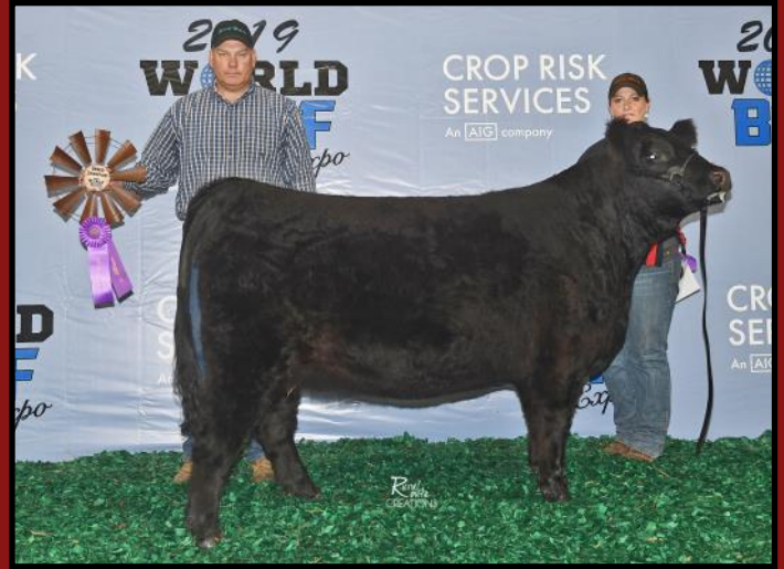
2019 WBE Galloway Show Grand Champion Heifer HB Flirt 2198, owned by Blegen Galloways, Roundup, MT