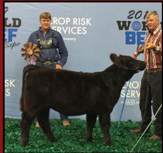
2019 WBE Galloway Show Reserve Champion Heifer Bar R Hope 42G owned by Bar R Galloways, Alden, MN