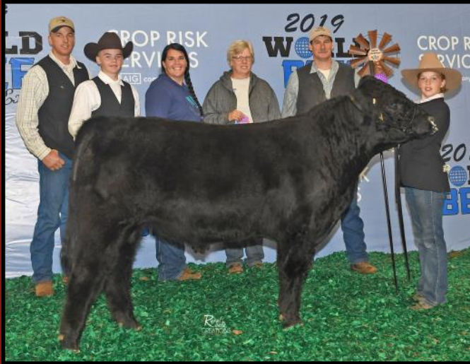
2019 WBE Galloway Show Grand Champion Bull RPG Fernando, owned by Root Prairie Galloways, Fountain, MN