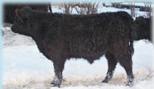
G3 out of above mentioned heifer bull