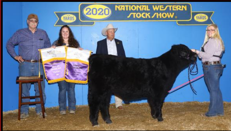
2020 NWSS Galloway Show Grand Champion Bull Berry's Galaxy 12G Berry Ranch Galloways, Mora, MN