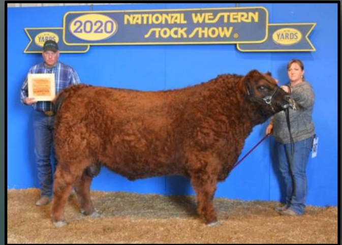
2020 NWSS Galloway Carcass Champion HB Ferrari Blegen Galloways Roundup, MT