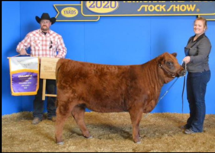
2020 NWSS Galloway Percentage Show Grand Champion Heifer CK Red John 48G CK Galloways, Fort Benton, MT (Registered Galloway cow X Black Angus bull)

Galloway: The BEST kept Secret in the beef industry.